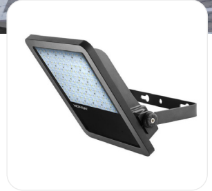
Noxion LED Floodlight Beam 40W 840 Assy.

To comply with the current standard for outdoor car parks, NEN-EN 12464-1:2021, the fixtures (e.g. LED floodlights) can be positioned as follows: On the long side one fixture per 6 parking spaces. Along the sides one fixture per 6 parking spaces. The mast height should be 6 meters. You should tilt the fixture 20° (relative to horizontal).